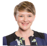
Bethan Sayed AM Plaid Cymru South Wales West