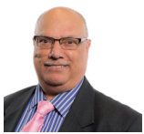
Mohammad Asghar AM Welsh Conservatives South Wales East