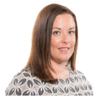
Vikki Howells AM Welsh Labour Cynon Valley